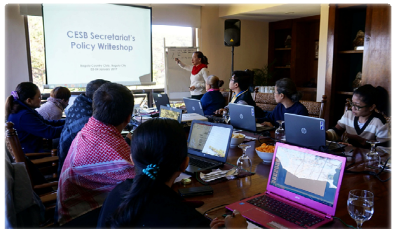
The CESB Secretariat doing CSW on the CES policies for discussion by the CES Governing Board.