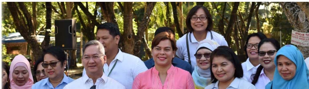
Davao City Mayor Sara Duterte-Carpio joins the new set of ARENA XI officers in a flag ceremony.