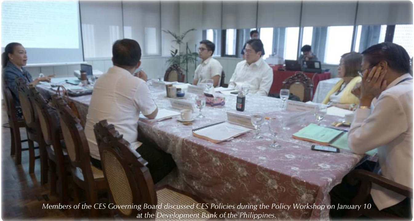
Members of the CES Governing Board discussed CES Policies during the Policy Workshop on January 10 at the Development Bank of the Philippines.

The Career Executive Service (CES) Governing Board conducted an extensive Policy Workshop on January 10, 2019 at the Development Bank of the Philippines as part of its continuing commitment to ensure relevant and timely policies for the CES.